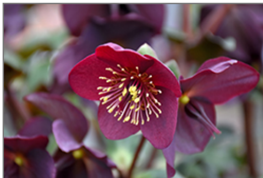
HGC Ice N' Roses Red Hellebore flowers

HGC Ice N' Roses Red Hellebore is recommended for the following landscape applications;