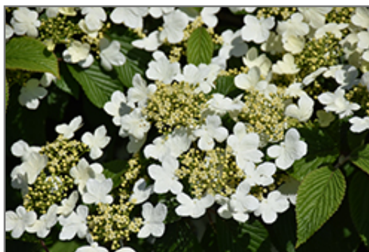
Wabi Sabi Doublefile Viburnum flowers

This is a relatively low maintenance shrub, and should only be pruned after flowering to avoid removing any of the current season's flowers. It is a good choice for attracting birds to your yard, but is not particularly attractive to deer who tend to leave it alone in favor of tastier treats. It has no significant negative characteristics.