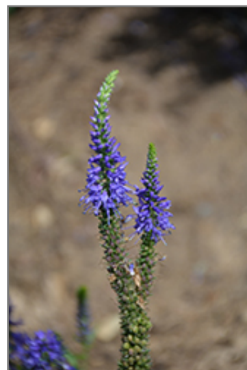
Magic Show Wizard of Ahhs Speedwell flowers