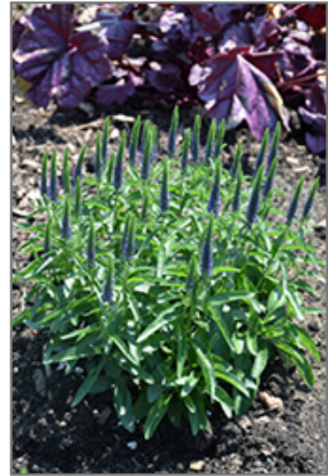
Magic Show Wizard of Ahhs Speedwell in bloom

This plant is not reliably hardy in our region, and certain restrictions may apply; contact the store for more information.