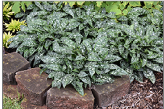
Twinkle Toes Lungwort

Twinkle Toes Lungwort is a fine choice for the garden, but it is also a good selection for planting in outdoor pots and containers. It is often used as a 'filler' in the 'spiller-thriller-filler' container combination, providing a mass of flowers and foliage against which the thriller plants stand out. Note that when growing plants in outdoor containers and baskets, they may require more frequent waterings than they would in the yard or garden. Be aware that in our climate, most plants cannot be expected to survive the winter if left in containers outdoors, and this plant is no exception. Contact our experts for more information on how to protect it over the winter months.