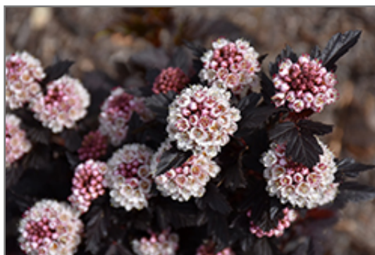
Royal Jubilee Ninebark flowers

This shrub will require occasional maintenance and upkeep, and can be pruned at anytime. Deer don't particularly care for this plant and will usually leave it alone in favor of tastier treats. It has no significant negative characteristics.