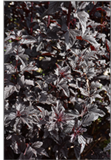
Royal Jubilee Ninebark foliage

This shrub does best in full sun to partial shade. It is very adaptable to both dry and moist locations, and should do just fine under average home landscape conditions. It is not particular as to soil type or pH. It is highly tolerant of urban pollution and will even thrive in inner city environments. This is a selection of a native North American species.