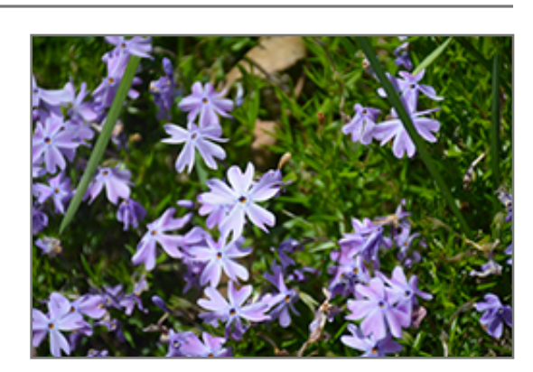
Blue Hills Moss Phlox flowers