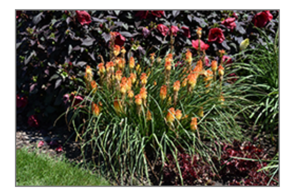
Pyromania Backdraft Torchlily in bloom

This is a relatively low maintenance plant, and should be cut back in late fall in preparation for winter. It is a good choice for attracting hummingbirds to your yard, but is not particularly attractive to deer who tend to leave it alone in favor of tastier treats. It has no significant negative characteristics.