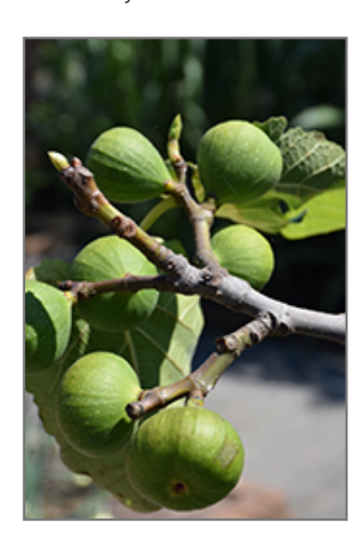
Black Jack Fig fruit