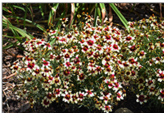
Sizzle And Spice Red Hot Vanilla Tickseed in bloom