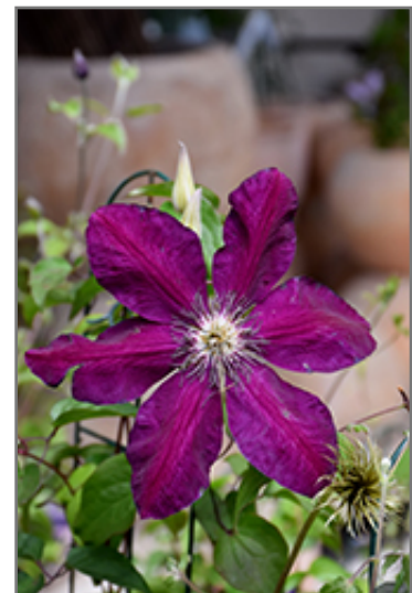
Westerplatte Clematis flowers