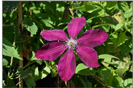
Westerplatte Clematis flowers

Westerplatte Clematis is recommended for the following landscape applications;