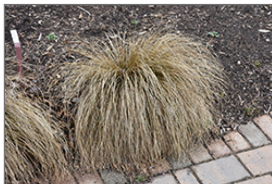
Prairie Fire Sedge

Prairie Fire Sedge is recommended for the following landscape applications;