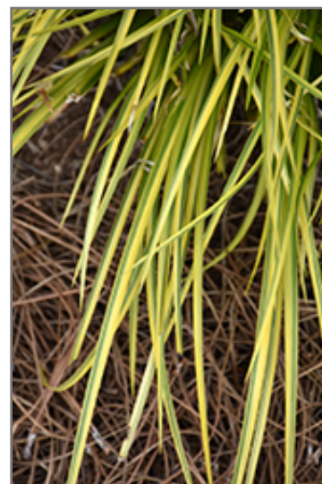
EverColor Everoro Japanese Sedge foliage