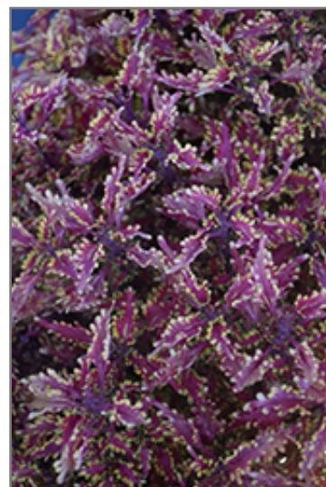
Terra Nova Scarlet Ibis Coleus foliage