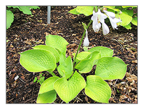
Midas Touch Hosta