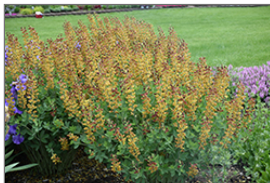
Decadence Cherries Jubilee False Indigo in bloom