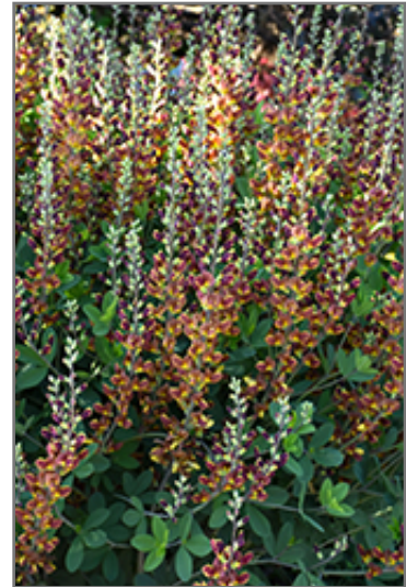
Decadence Cherries Jubilee False Indigo flowers

This plant is not reliably hardy in our region, and certain restrictions may apply; contact the store for more information.