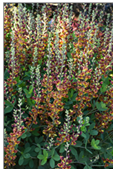
Decadence Cherries Jubilee False Indigo flowers

This plant is not reliably hardy in our region, and certain restrictions may apply; contact the store for more information.