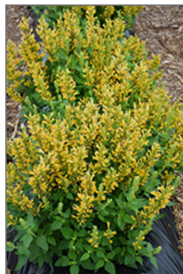
Poquito Butter Yellow Hyssop in bloom