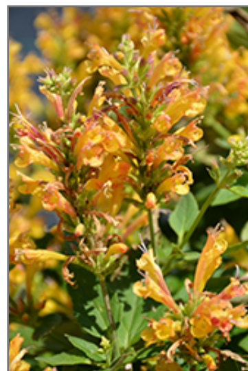
Poquito Butter Yellow Hyssop flowers