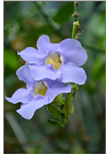
Blue Trumpet Vine flowers