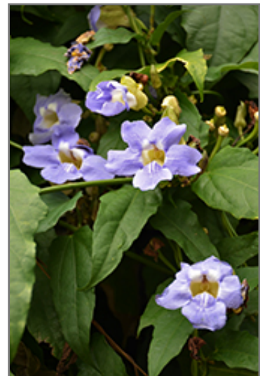
Blue Trumpet Vine flowers