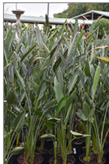
Gold Crest Yellow Bird Of Paradise

A beautiful and bold structural plant that forms large clumps of stiff foliage growing up from the base; stunning flowers of yellow and blue rise high above the foliage, giving the appearance of a birds head; great cut flower; shelter from frost