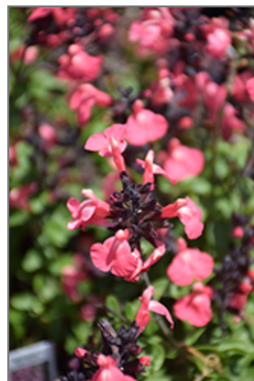
Mirage Salmon Autumn Sage flowers

Mirage Salmon Autumn Sage is recommended for the following landscape applications;