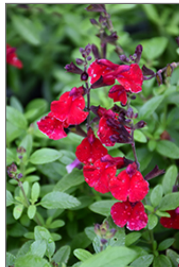
Mirage Cherry Red Autumn Sage flowers

Mirage Cherry Red Autumn Sage is recommended for the following landscape applications;