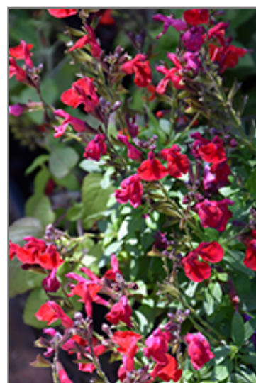
Mirage Cherry Red Autumn Sage flowers