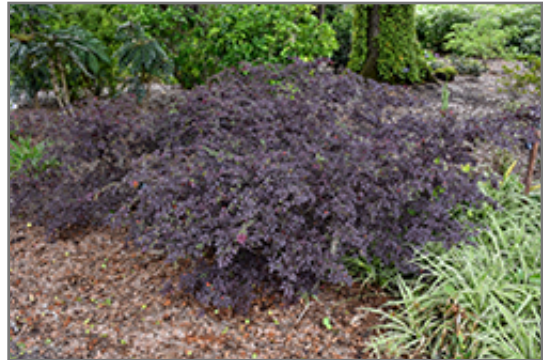
Purple Daydream Fringeflower