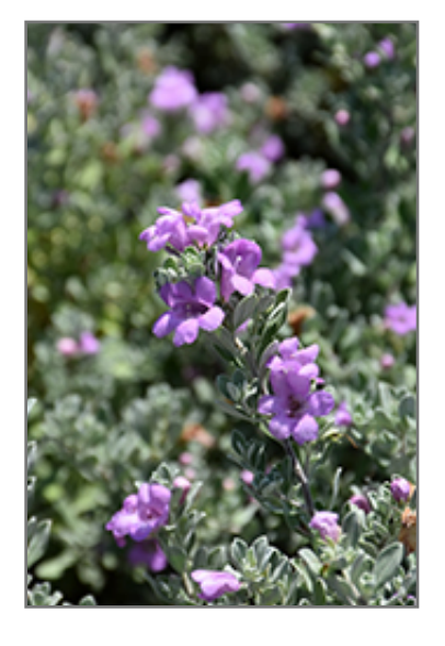
Desperado Texas Sage flowers

Desperado Texas Sage is a multi-stemmed evergreen shrub with an upright spreading habit of growth. Its relatively fine texture sets it apart from other landscape plants with less refined foliage.