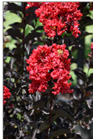
Ebony Fire Crapemyrtle flowers