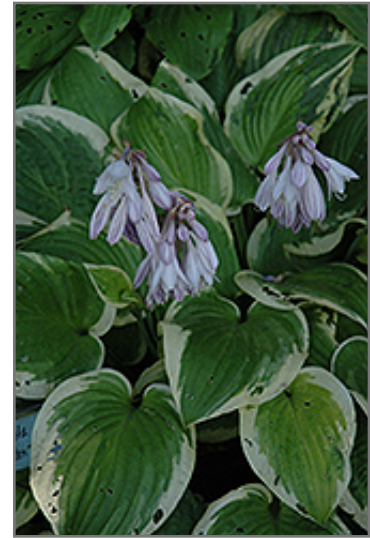
Golden Tiara Hosta flowers

Golden Tiara Hosta will grow to be about 12 inches tall at maturity extending to 18 inches tall with the flowers, with a spread of 3 feet. When grown in masses or used as a bedding plant, individual plants should be spaced approximately 30 inches apart. Its foliage tends to remain dense right to the ground, not requiring facer plants in front. It grows at a medium rate, and under ideal conditions can be expected to live for approximately 10 years. As an herbaceous perennial, this plant will usually die back to the crown each winter, and will regrow from the base each spring. Be careful not to disturb the crown in late winter when it may not be readily seen!