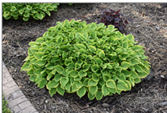
Golden Tiara Hosta