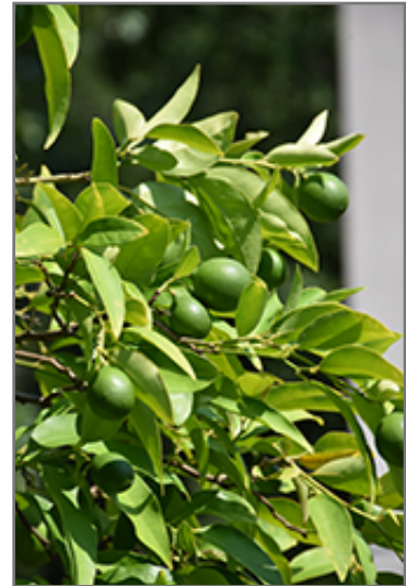
Key Lime fruit