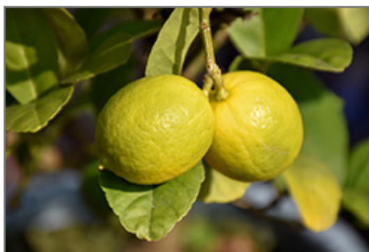
Key Lime fruit