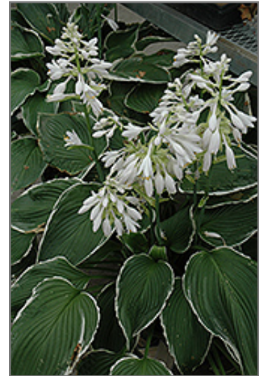
Frosted Jade Hosta flowers

Frosted Jade Hosta is recommended for the following landscape applications;