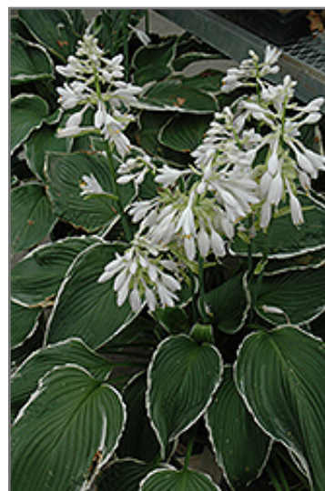
Frosted Jade Hosta flowers

Frosted Jade Hosta is recommended for the following landscape applications;