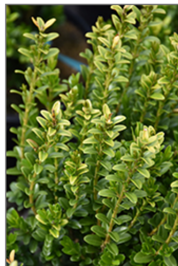
Wee Willie Boxwood foliage