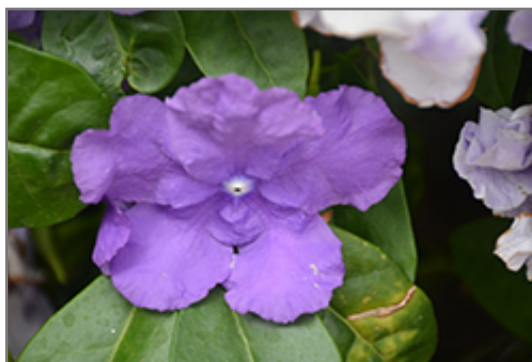
Yesterday Today And Tomorrow flowers