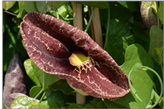
Giant Dutchman's Pipe flowers