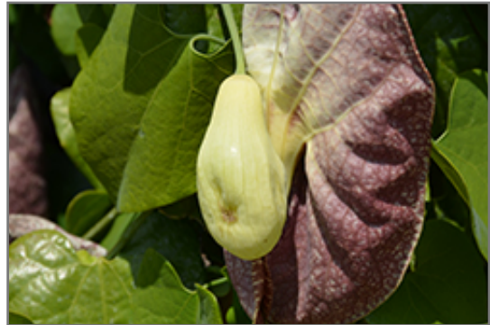
Giant Dutchman's Pipe flowers

This plant is not reliably hardy in our region, and certain restrictions may apply; contact the store for more information.