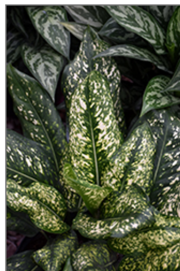
Lumina Chinese Evergreen foliage