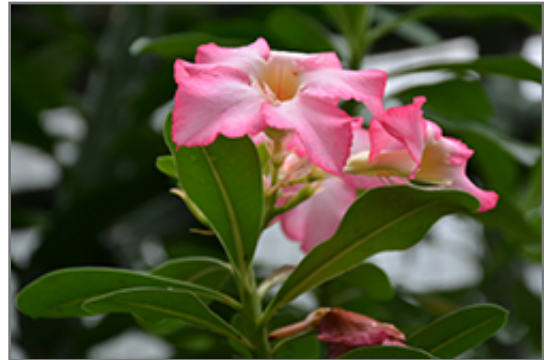
Desert Rose flowers

Desert Rose is recommended for the following landscape applications;