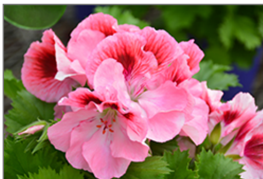
Elegance Ballet Geranium flowers

Elegance Ballet Geranium is recommended for the following landscape applications;