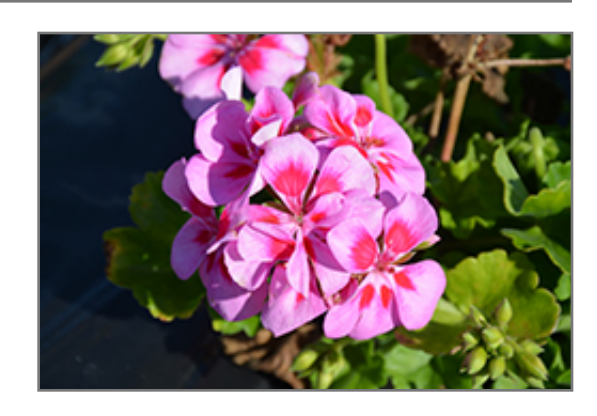
Classic Calypso Geranium flowers