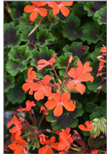
Brocade Fire Night Geranium flowers