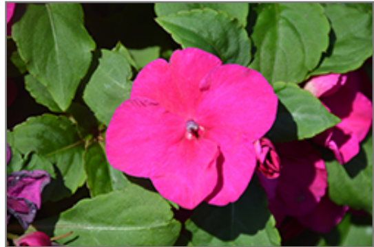
Accent Premium Violet Impatiens flowers

Accent Premium Violet Impatiens is recommended for the following landscape applications;