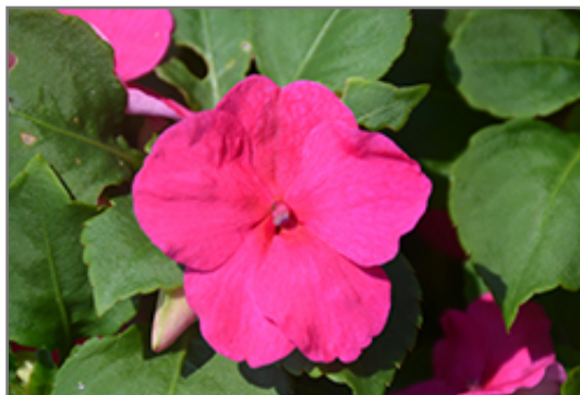
Accent Premium Rose Impatiens flowers