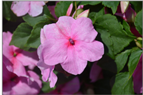
Accent Premium Pink Impatiens flowers

Accent Premium Pink Impatiens is recommended for the following landscape applications;