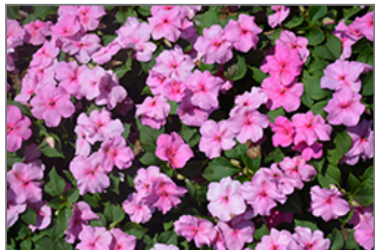
Accent Premium Pink Impatiens flowers