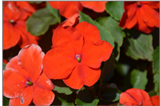
Accent Premium Deep Orange Impatiens flowers