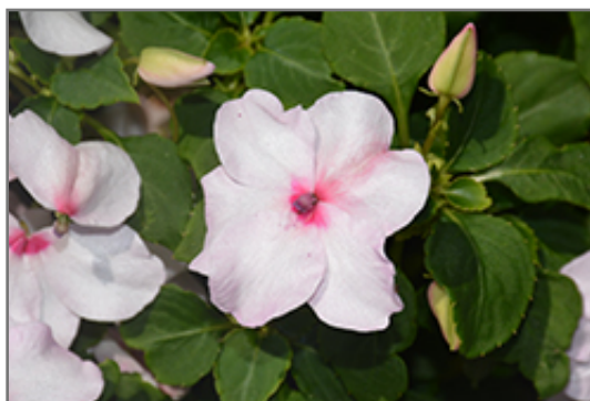
Accent Premium Bright Eye Impatiens flowers