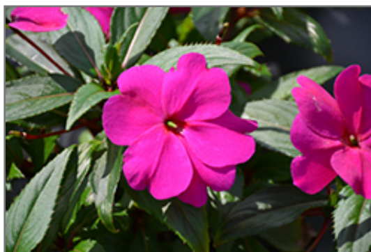
Divine Orchid New Guinea Impatiens flowers