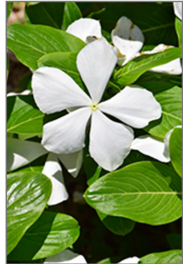
Mega Bloom White Vinca flowers

Mega Bloom White Vinca is recommended for the following landscape applications;