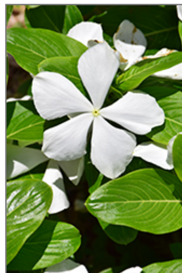
Mega Bloom White Vinca flowers

Mega Bloom White Vinca is recommended for the following landscape applications;