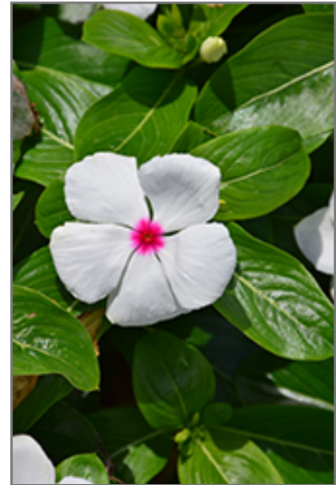
Mega Bloom Polka Dot Vinca flowers

Mega Bloom Polka Dot Vinca is recommended for the following landscape applications;