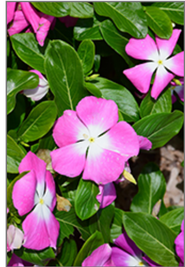
Mega Bloom Pink Halo Vinca flowers

Mega Bloom Pink Halo Vinca is recommended for the following landscape applications;