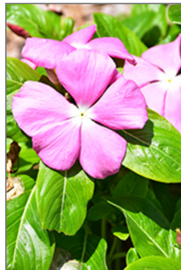
Mega Bloom Pink Vinca flowers

Mega Bloom Pink Vinca is recommended for the following landscape applications;