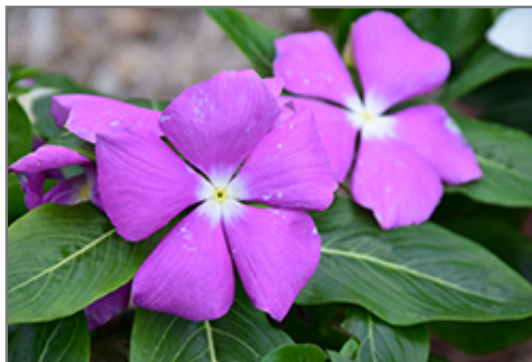
Mega Bloom Deep Lavender Vinca flowers

Mega Bloom Deep Lavender Vinca is recommended for the following landscape applications;