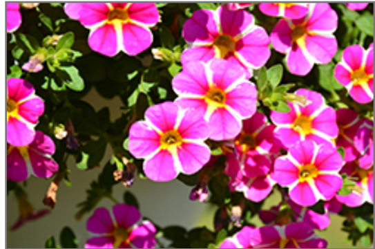
StarShine Pink Calibrachoa flowers