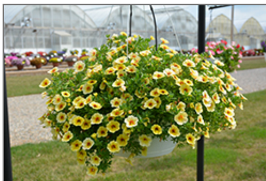
MiniFamous Neo Yellow Red Vein Calibrachoa in bloom

MiniFamous Neo Yellow Red Vein Calibrachoa is a fine choice for the garden, but it is also a good selection for planting in outdoor containers and hanging baskets. Because of its trailing habit of growth, it is ideally suited for use as a 'spiller' in the 'spiller-thriller-filler' container combination; plant it near the edges where it can spill gracefully over the pot. Note that when growing plants in outdoor containers and baskets, they may require more frequent waterings than they would in the yard or garden.