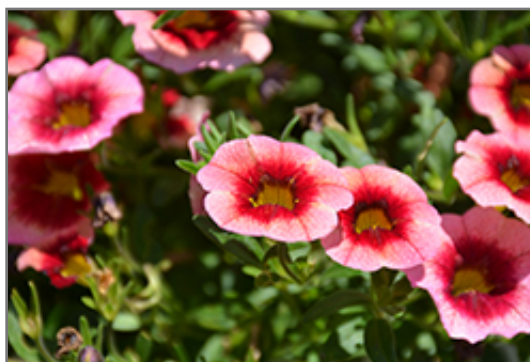
MiniFamous Neo Pink Strike Calibrachoa flowers

MiniFamous Neo Pink Strike Calibrachoa is recommended for the following landscape applications;