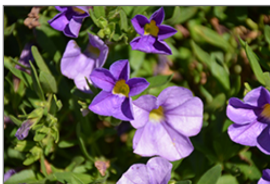
MiniFamous Neo Light Blue Calibrachoa flowers