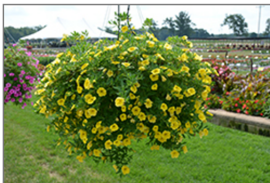
MiniFamous Neo Deep Yellow Calibrachoa in bloom

MiniFamous Neo Deep Yellow Calibrachoa is a fine choice for the garden, but it is also a good selection for planting in outdoor containers and hanging baskets. Because of its trailing habit of growth, it is ideally suited for use as a 'spiller' in the 'spiller-thriller-filler' container combination; plant it near the edges where it can spill gracefully over the pot. Note that when growing plants in outdoor containers and baskets, they may require more frequent waterings than they would in the yard or garden.