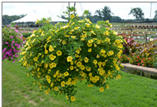
MiniFamous Neo Deep Yellow Calibrachoa in bloom

MiniFamous Neo Deep Yellow Calibrachoa is a fine choice for the garden, but it is also a good selection for planting in outdoor containers and hanging baskets. Because of its trailing habit of growth, it is ideally suited for use as a 'spiller' in the 'spiller-thriller-filler' container combination; plant it near the edges where it can spill gracefully over the pot. Note that when growing plants in outdoor containers and baskets, they may require more frequent waterings than they would in the yard or garden.